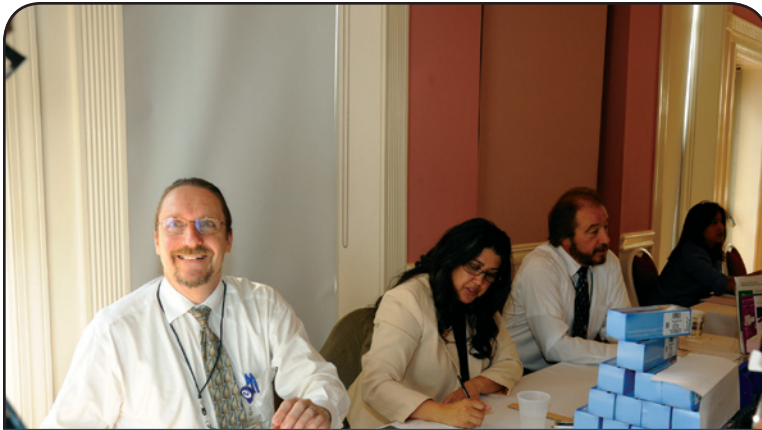
U.S.P.S. Postal Consultation Table